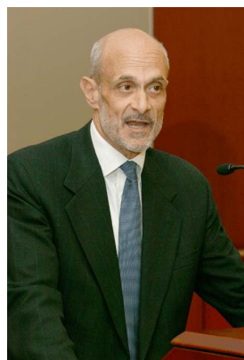
Judge Michael Chertoff

The Honorable Michael Chertoff of the United States Court of Appeals for the Third Circuit delivered the 2003 Paul S. Miller Distinguished Lecture on Oct. 20 in the Baker Trial Courtroom. Judge Chertoff spoke on "The Relationship Between Security and Individual Rights in Today's Society." From 2001 until joining the Court of Appeals in June 2003, Judge Chertoff was assistant attorney general for the Criminal Division at the U.S. Department of Justice, where he directed the national prosecution effort against terrorism as well as major prosecutions against corporate fraud. The New Jersey Lawyer (Oct. 27) and New Jersey Law Journal (Nov. 3) covered the lecture.